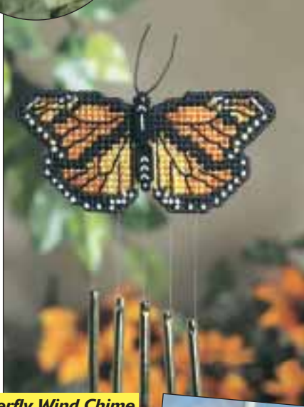
Butterfly Wind Chime

Nothing says, "Welcome to our home" better than a cheery door decoration you make yourself.