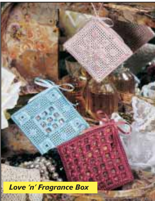
Love 'n' Fragrance Box

From unique potpourri holders to perfumed sachets, these sweet-scents sensations will soothe your senses with their eye-pleasing designs and delightful aromas.