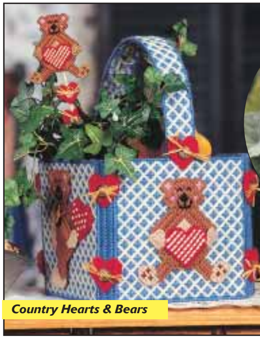
Country Hearts & Bears

helps you add your personal touch to every room!